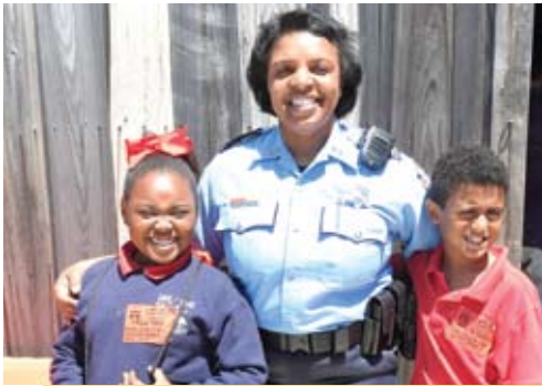
Honor Roll Roundup

Let us know if you'd like our participation in your event. We'd welcome the opportunity to visit.