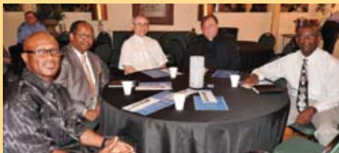
Sheriff's Prayer Breakfast