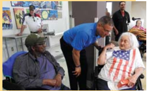
War Veterans Home Visit